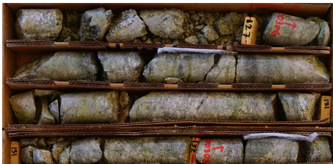
Figure 1 - LP22-SW05 Interval 127 - 132 feet (38.1 – 40.2m) TREO: 758ppm

LP22-SW05 contains a zone of mineralised mylonite rock from 127 feet to 132 feet (38.1m – 40.2m) with a TREO grade of 758ppm.