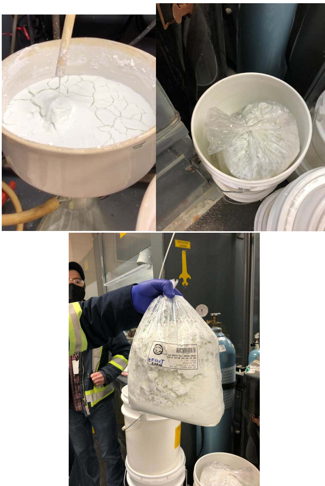
Figures 5-7: Mixed rare earth carbonate sample ready for transportation to REEtec