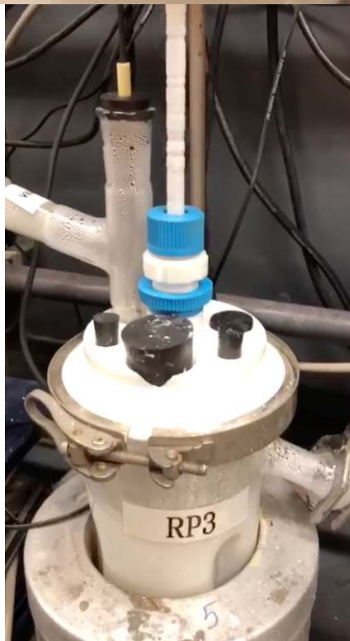
Figures 1-4: Customer bulk sample undergoing leaching and purification