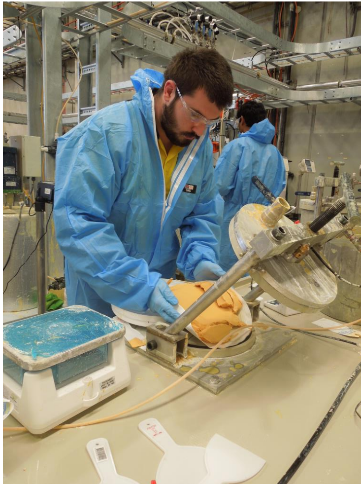
Refined NdPr-rich Rare Earth Hydroxide Precipitate being removed from filter unit