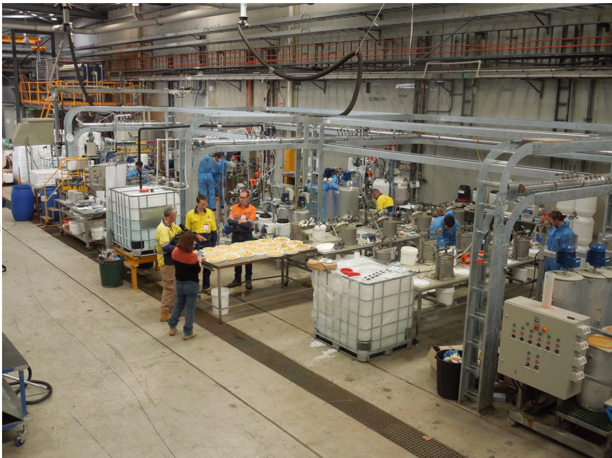
Phase 5 Rare Earth Purification and Precipitation Pilot Plant