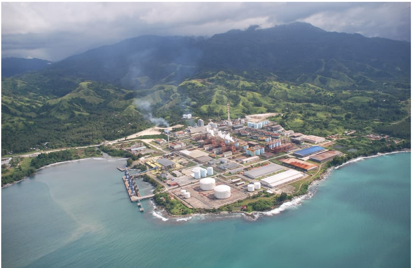
FIGURE 1: Aerial view of the Ramu JV nickel-cobalt operation in PNG