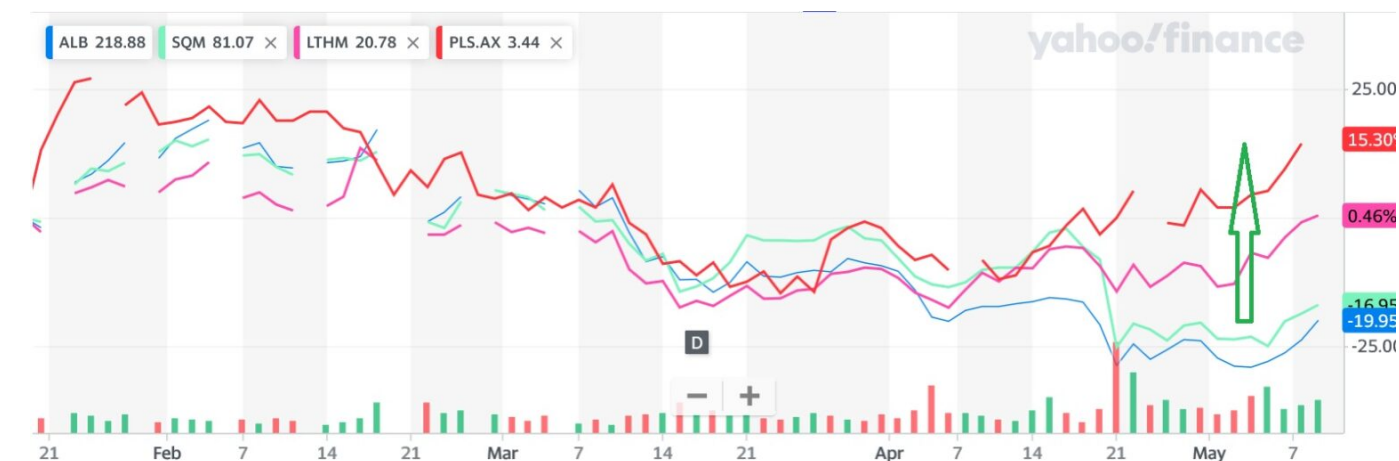
FIGURE 2: Leading lithium stocks have been moving higher in May buoyed by improving EV sales and lithium prices (NYSE: ALB, NYSE: SQM, NYSE: LTHM, ASX: PLS)

As shown on the chart below, February, March, and April saw the leading lithium stocks (Albemarle Corporation (NYSE: ALB), Sociedad Química y Minera de Chile S.A. (NYSE: SQM), Livent Corporation (NYSE: LTHM), and Pilbara Minerals Limited (ASX: PLS)) follow spot prices lower; however, in May we can see a potential price recovery starting (green arrow in chart below).