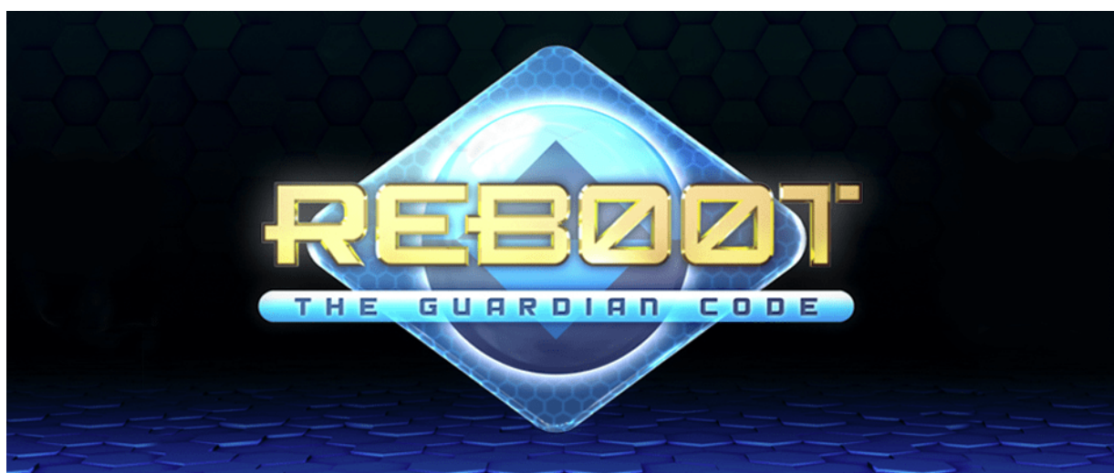
WOW!'s ReBoot CG series

Rainmaker Studios is a multi-faceted animation studio and one of Canada's largest producers of computer graphics ('CG') animation. Originally established as Mainframe Entertainment, the Company produced the first-ever CG animated series, ReBoot, and over the course of its 15+ years of innovative history, Rainmaker Studios has continued to break new ground in animation. In addition, Rainmaker has produced with partners and clients including Mattel, The Weinstein Company, Hasbro, Lionsgate and Sony. These are some of the big names in the industry. Rainmaker Studios also develops proprietary projects.