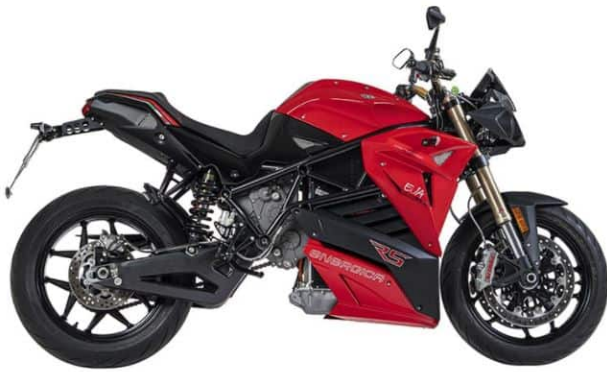
ENERGICA EVA RIBELLE RS

adoption. Plus these Italian superbikes are pretty awesome to look at.