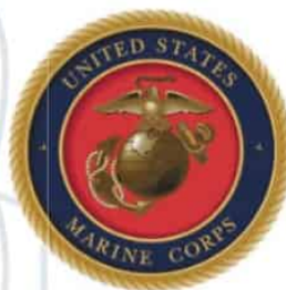
UNITED STATES MARINES