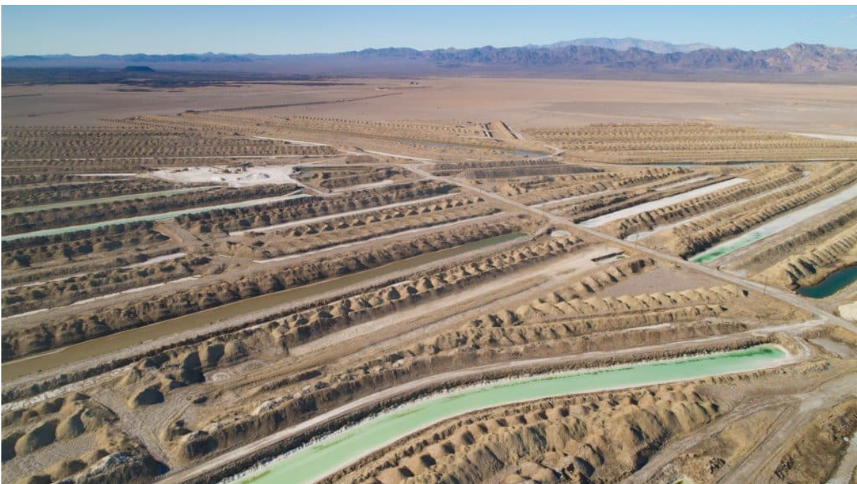
Bristol Lake brine operations