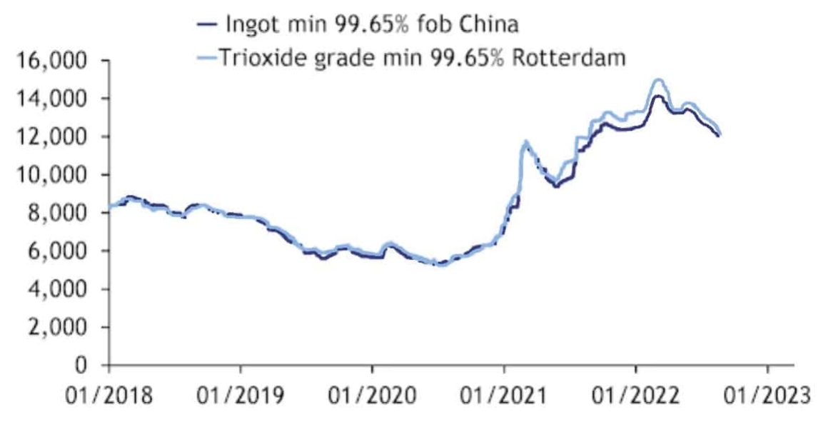
FIGURE 2: Antimony Market Prices (US$/tonne)