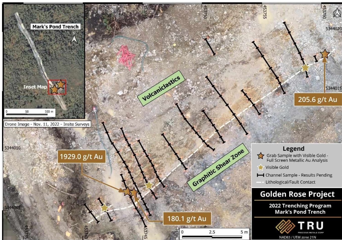
Figure 2: Grab sample results within Mark's Pond trench To view an enhanced version of Figure 2, please visit: https://images.newsfilecorp.com/files/5993/145415_d703970ac4267a6a_002full.jpg