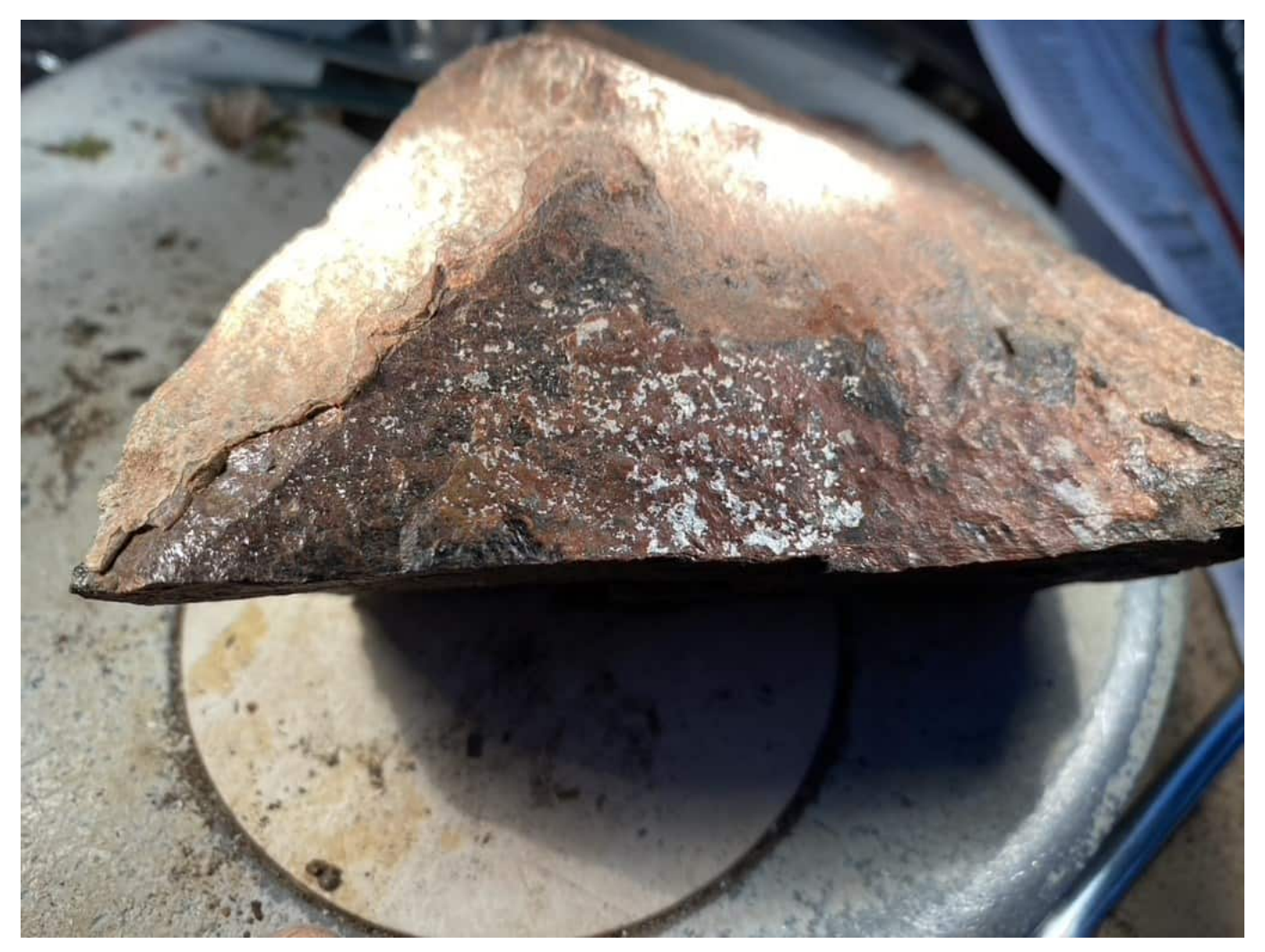
Native silver in diabase rock sample collected from the floor of the Treasure Room, Buckeye Mine

sample provided to Dr. McDonald was a malformed dore bar poured by SBMI in September, 2022 derived from the Buckeye Mine, containing highly refractory "unknown material."