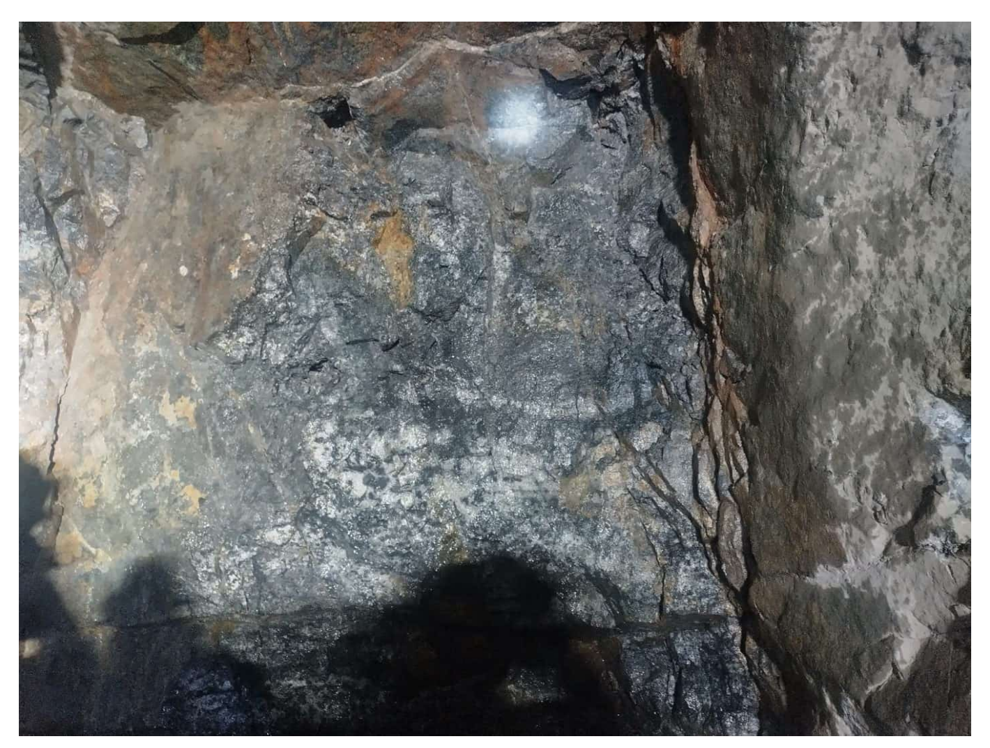
Development drift intersecting a wall of sulphides at the Buckeye Mine, Jan. 28, 2023

To view an enhanced version of this graphic, please visit: <a href="https://images.newsfilecorp.com/files/8464/153012_bf88da37d4d289">https://images.newsfilecorp.com/files/8464/153012_bf88da37d4d289</a> el 001full.jpg