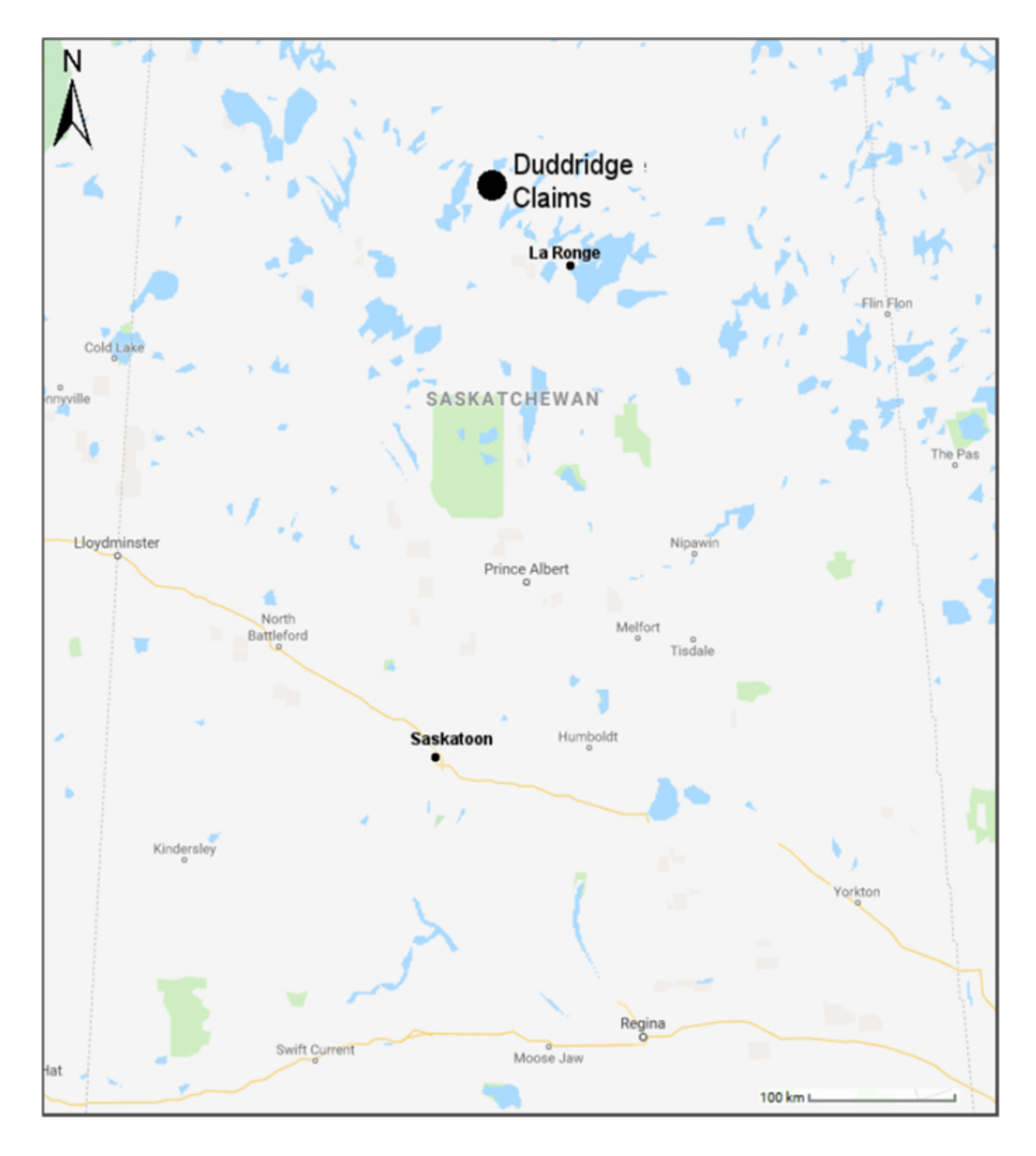
Location of Duddridge Lake claims in Northern Saskatchewan

Table 1 below shows the cobalt, vanadium, copper, lead and uranium assays of the 39 boulder samples collected by Fission in 2012. The data was derived from Appendix 3 of the Saskatchewan