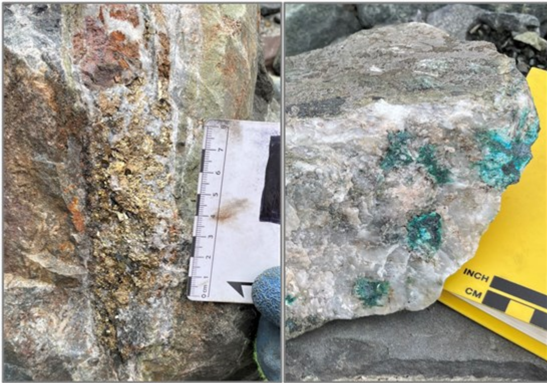
Plate 2 (left): 5 cm wide pyrite-quartz vein flanked by pervasive green epidote alteration.

Plate 3 (right): Example of quartz veinlet with primary copper sulphides and secondary, blue-green copper minerals.