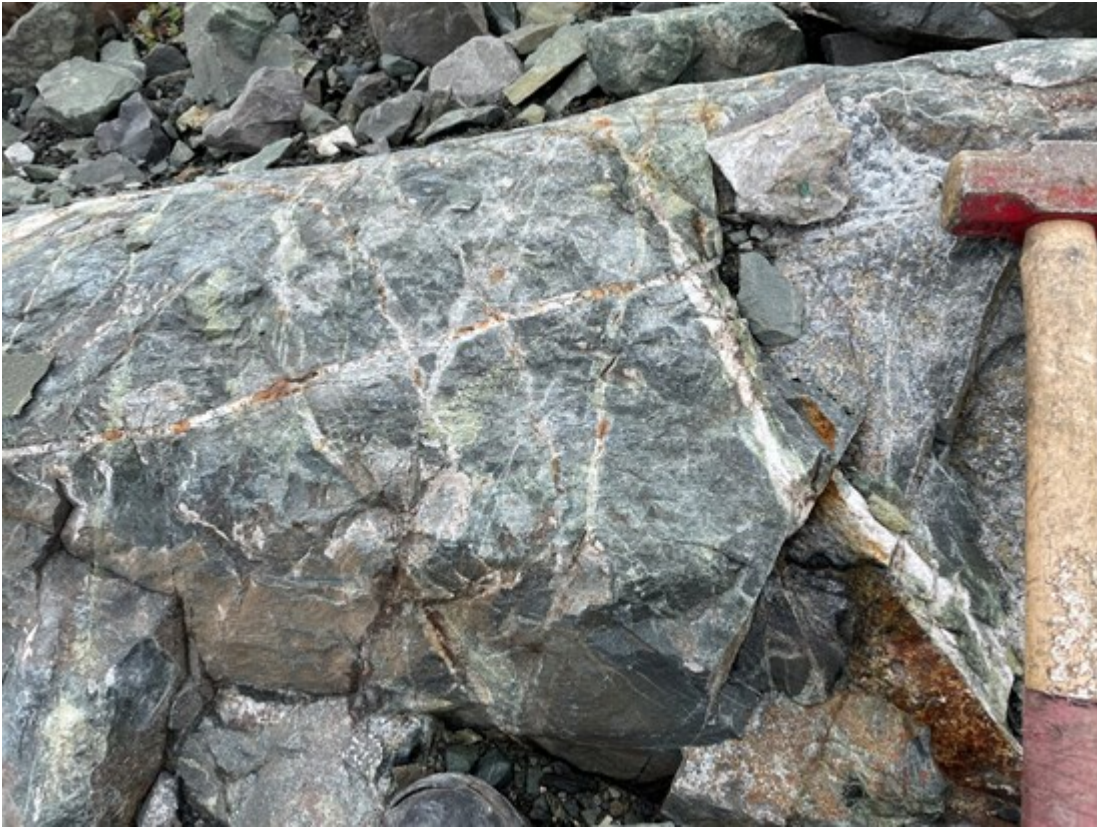
Plate 1: Example of an epidote altered, quartz-pyrite+/- chalcopyrite veinlet stockwork outcrop, TREK South claims. Small sledge hammer for scale.

To view an enhanced version of this graphic, please visit: