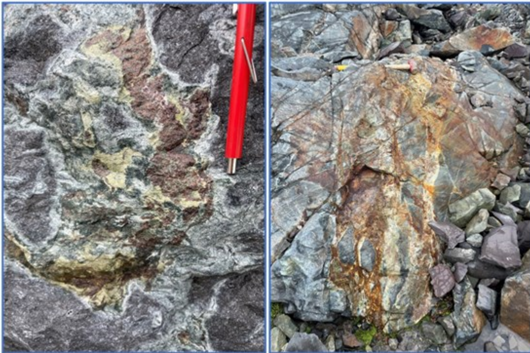
PHOTO 1 (Left): Close-up view of part of the extensive garnet-epidote-amphibole skarn network on the west margin of the Trek South porphyry system (red pencil magnet section is 7 cm long). PHOTO 2 (Right): Example of the mineralized pyrite +/- quartz veinlet stockwork at Trek South (hammer at top is approx. 81 cm long).

To view an enhanced version of Photo 1 and Photo 2, please visit: