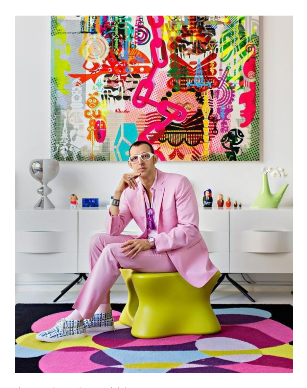
Pictured Karim Rashid

If you cannot view this image, please visit: <a href="https://investornews.wpengine.com/wp-content/uploads/2022/11/694">https://investornews.wpengine.com/wp-content/uploads/2022/11/694</a> <a href="mailto:59">59</a> affa6d480485ab83 001full-1.jpg