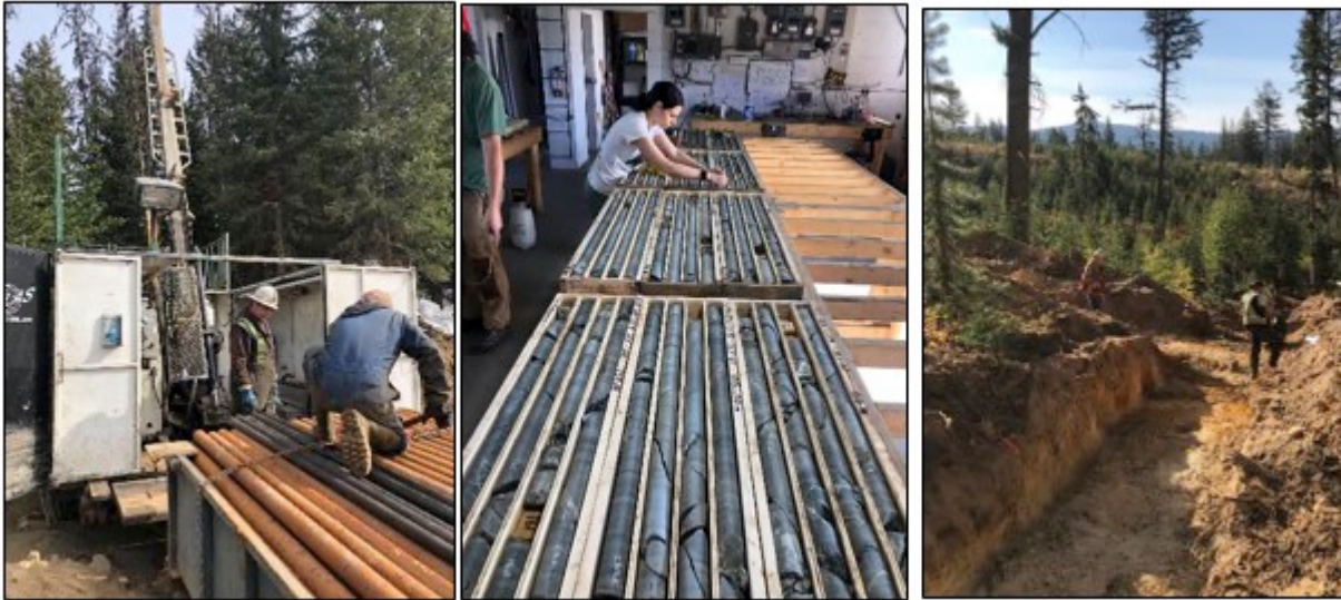
Figure 2: 2022 Field operations at the MPD Project (drilling, core logging, trenching)

https://images.newsfilecorp.com/files/3803/147915_6db8d4eea4d46815_002full.jpg