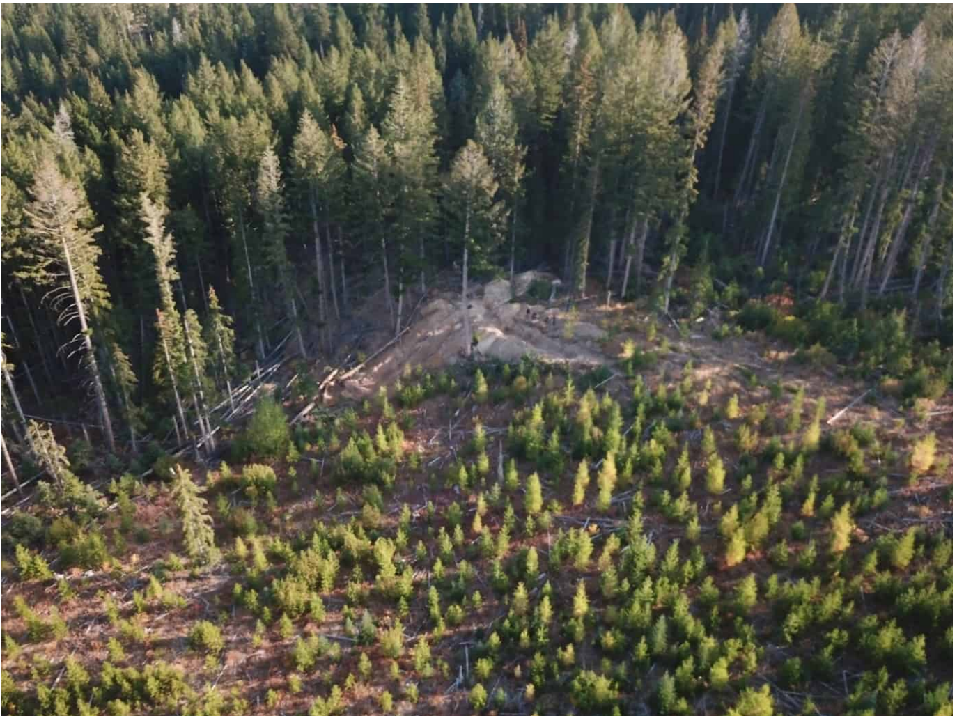
Figures 3: Beyer Zone Trenching

Strong geological similarities were noted with the historic trenches at the Man Zone 400 metres north, where mineralization is also hosted by complex hydrothermally altered argillic rocks with higher grade gold-silver zones occurring with southeasterly trending fault contacts.