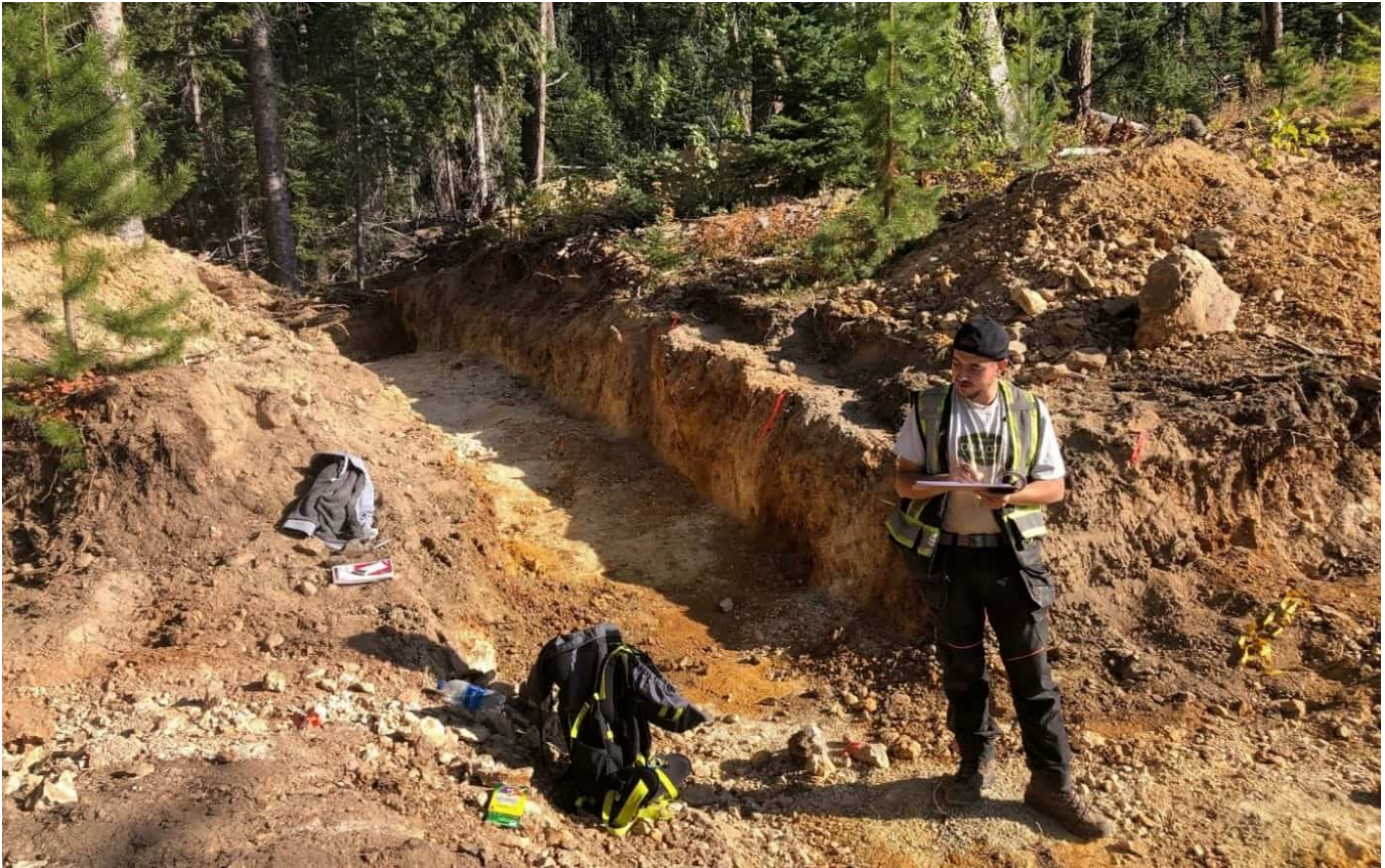
Figures 3: Beyer Zone Trenching

To view an enhanced version of Figures 3, please visit: https://images.newsfilecorp.com/files/3803/146701_92f20d2bd47b98a8_005full.jpg