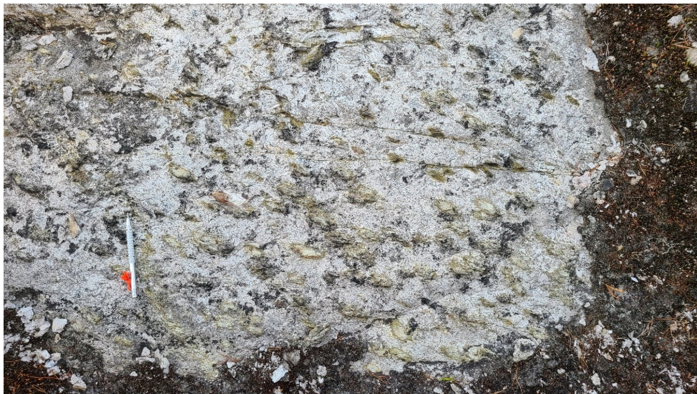
Figure 3: Main discovery. Spodumene-rich pegmatite, with aureole of Li-mica.