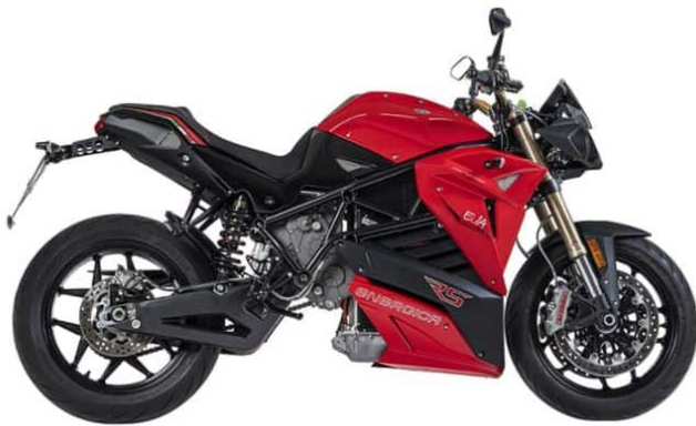
ENERGICA EVA RIBELLE RS

Covid re-introduced a lot of people back into all-terrain vehicles and motorcycles. As more options for zero emission “toys” become available I think this could be a huge growth segment for the Company as Energica targets markets that have demonstrated a propensity for early electric vehicle adoption. Plus these Italian superbikes are pretty awesome to look at.