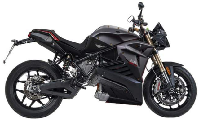
ENERGICA EVA RIBELLE