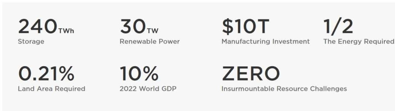
Figure 2: Estimated Resources & Investments Required for Master Plan 3