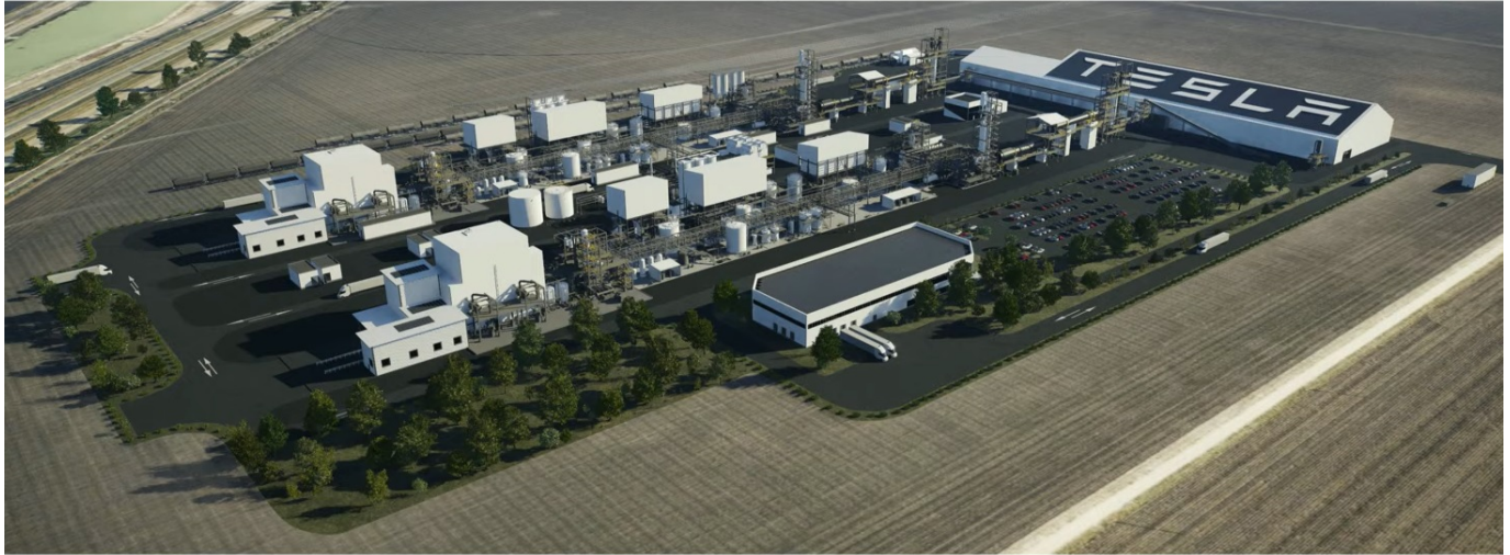
FIGURE 2: Schematic of Tesla's under-construction lithium refinery at Corpus Christi, Texas, USA