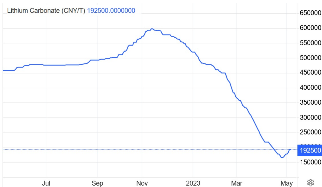
FIGURE 1: China lithium carbonate spot prices appear to be rebounding after hitting a low in late April 2023

The first quarter in 2023 was a rough period for lithium stocks as the China lithium carbonate spot price crashed lower. However, the second quarter is looking a lot better.