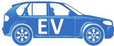
Autonomous and electric vehicles