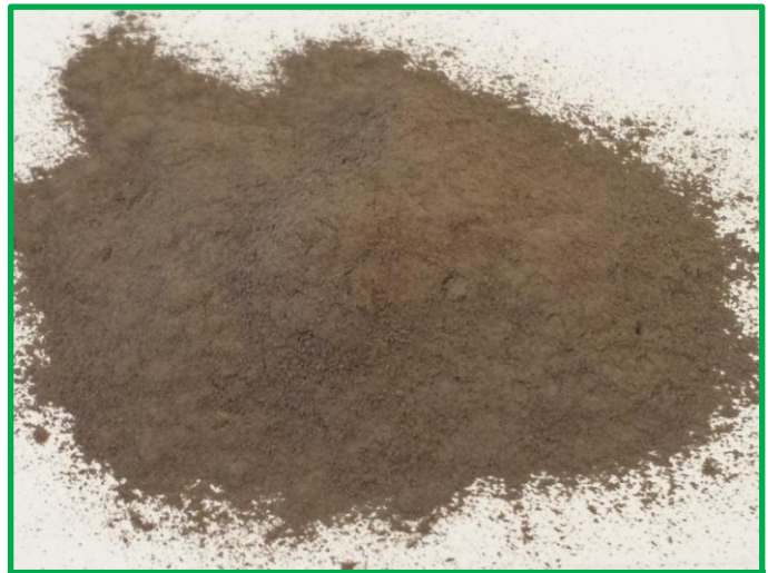
Finely ground bulk phosphate sample to 100Mesh (150 micron)