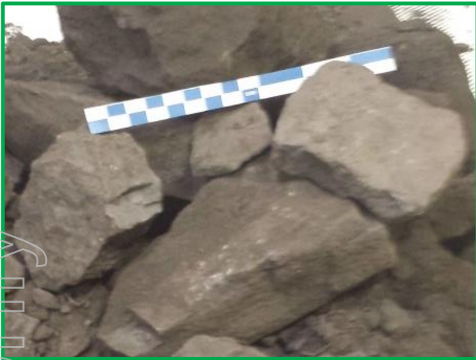
2-tonne bulk sample collected in October 2013 (23% P 2 O 5 )